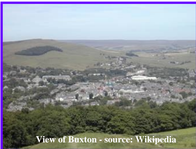
View of Buxton

The JEB meeting will be taking place on Saturday 19th and Sunday 20th July 2008 and we would love to see you there. Buxton is easily accessible by public transport, having a direct rail link with Manchester. Trains depart Manchester on a regular basis with the journey taking around one hour and costing in the region of £8. More information is available from http://www.nationalrail.co.uk Of course, Buxton is also easily accessible by car and you can read more about the town and get directions at the local website: http://www.visitbuxton.co.uk